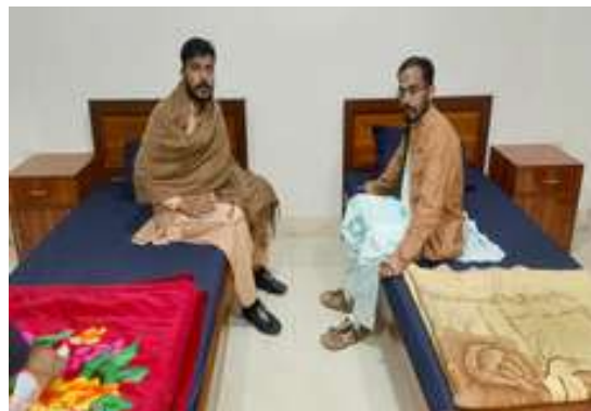
AIR CONDITIONED HOSTEL ROOMS