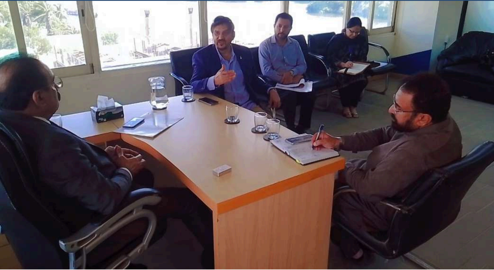
Meeting with ED- STEDA